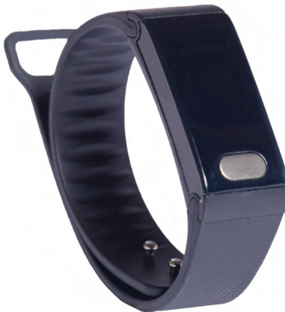
Wristband colors will be announced by prelaunch.

CareWear is to be worn in close contact to clean skin around the left wrist in a high position for optimal readings from the sensor window.